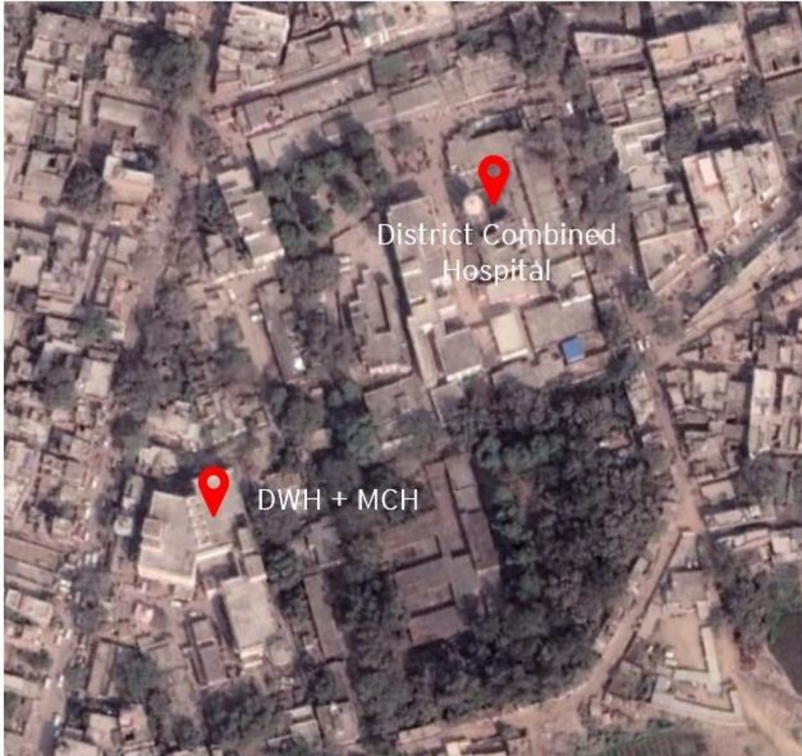
Site demarcation for District Hospital