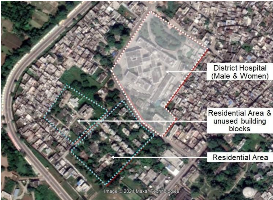
Site demarcation for District Hospital