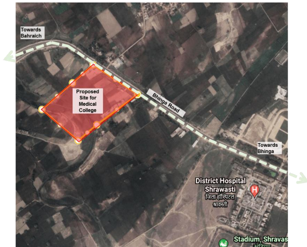
Proposed Site for Medical College

The Private Player will be handed over the District Hospital, along with the above land parcel for development of Medical College.